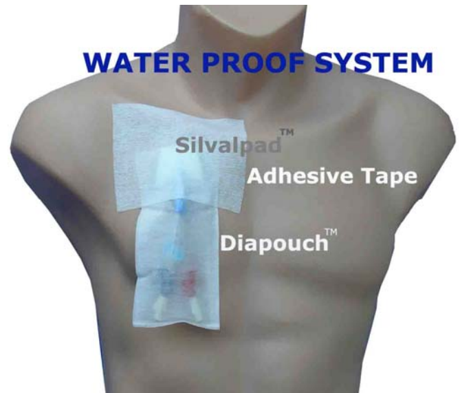
CATHETER PRESERVATION WATERPROOF PACK*

CATHETER PRESERVATION PACK – DIAPOUCH™ Catalog No. 01148: